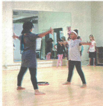
The entire community is welcome to attend the Dance-A-Thon at Luna Dance Institute on Saturday, March 7.